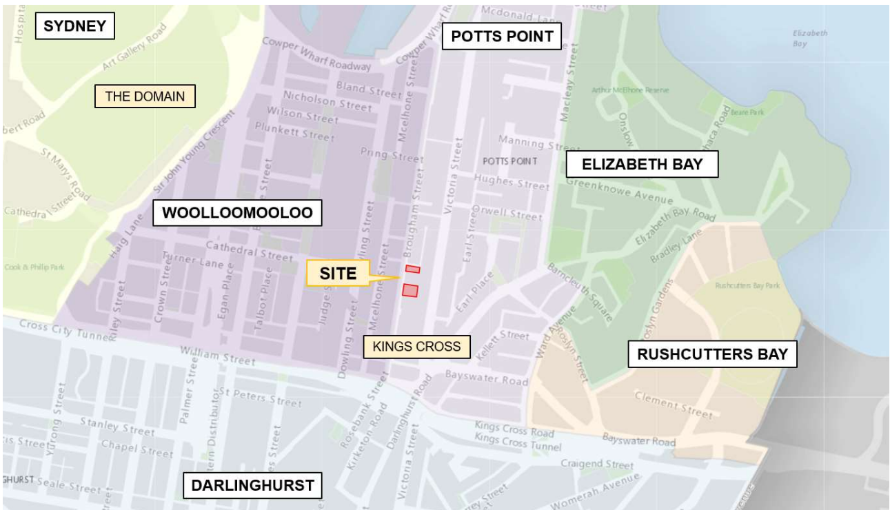
Figure 2. Indicative plan showing the site's context and suburb boundaries